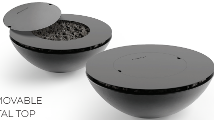
REMOVABLE METAL TOP